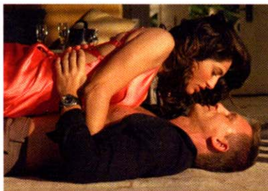
Return on Bonds: Entertainment properties like Casino Royale are most discussed.